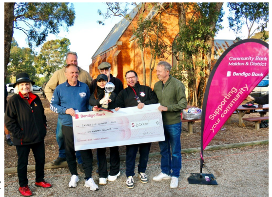
Winners of the 2025 Forster Cup.

Please consider making a contribution to the hamper.